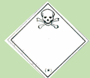
Figure 1 : Toxic substances