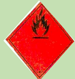
Figure 2 : Inflammable liquid